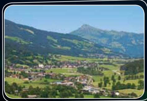
Brixen im Thale